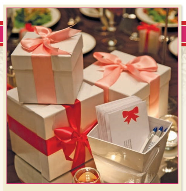
"White Gift" centerpieces honored our long standing tradition.