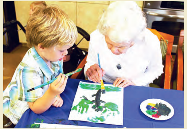
Our new Art 4 The Ages class is a big hit. This monthly "pop-in" art class is taught by Lakewood Conservatory of Fine Arts and is attended by children of the neighborhood and residents of Fowler.