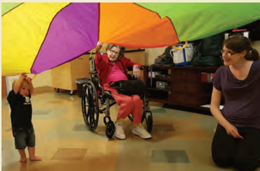
Enjoying our weekly Mommy and Me Music Class!